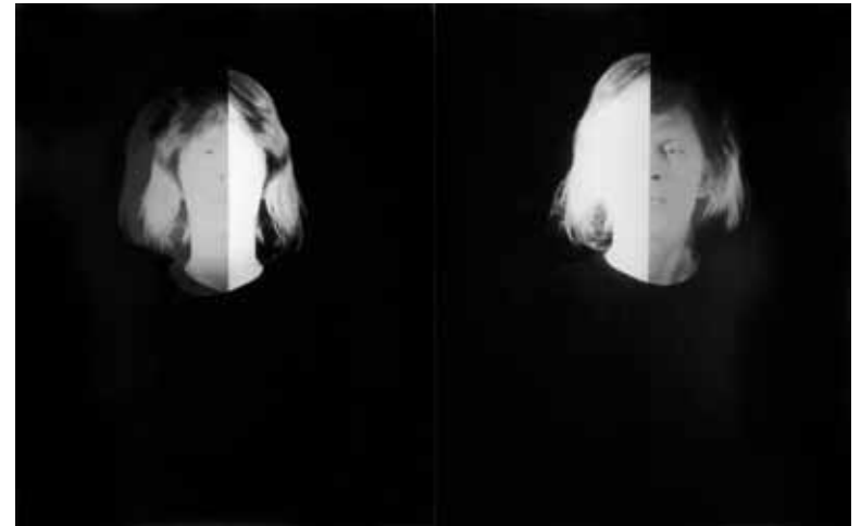
Wincenty Dunikowski-Duniko, The Hold VIII, 1978 Transparent photography, 49,7 x 79,5 cm