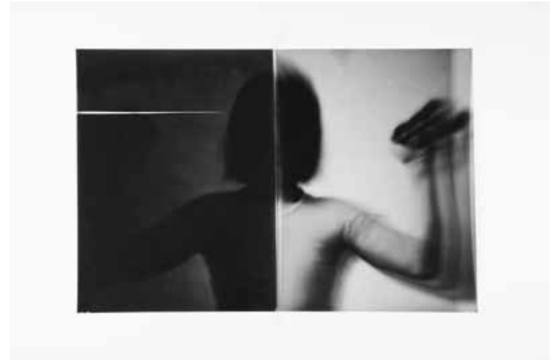
Wincenty Dunikowski-Duniko, The Hold , 1979 Transparent photography, 39,7 x 59,4 cm