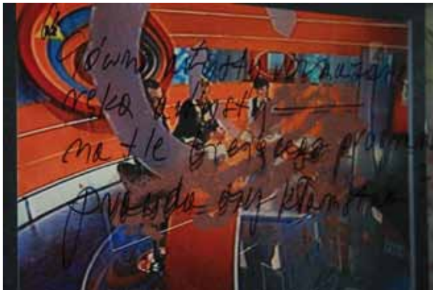
Wincenty Dunikowski-Duniko, Current Programme XIX (shitty affair) installation: TV receivers, current pro- gramme, glass, texts, pedestal size: about 220 x 70 x 70