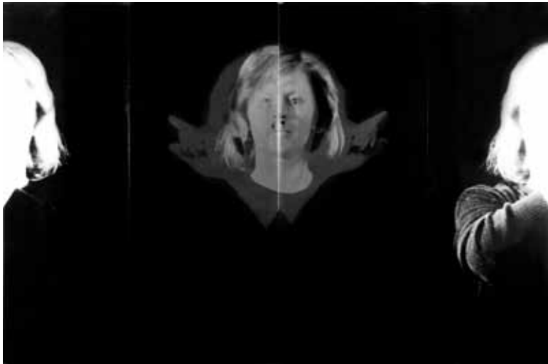
Wincenty Dunikowski-Duniko, The Hold VI , 1978 Transparent photography, 39,7 x 59,5 cm