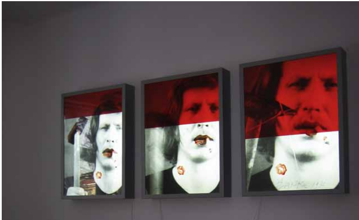
Wincenty Dunikowski-Duniko, Hammering Artist, 1976/2007, trans- parent photography in a lightbox, 3 x (130 x 90 x 17 cm). Edition: 10