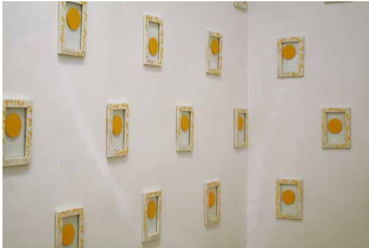
Wincenty Dunikowski-Duniko, Pink Point of No Return, 1992/99, 100 wooden frames with an inscription, screen-print on glass. Edition: 3