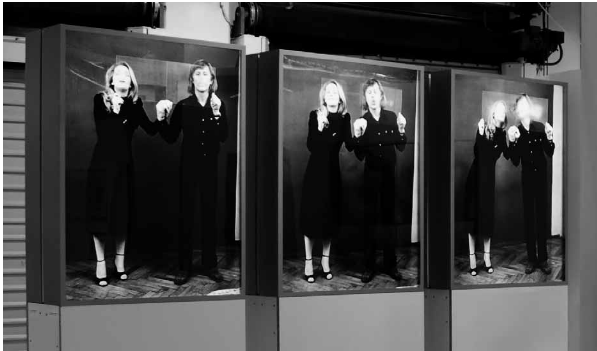
Wincenty Dunikowski-Duniko, Common Printing with Breath, 1980/2007, transparent photography in a lightbox, 3 x (130 x 90 x 17 cm). Edition: 5