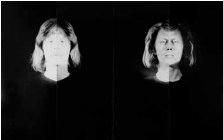
Wincenty Dunikowski-Duniko, The Hold VII, 1978 Transparent photography, 49,7 x 76,2 cm