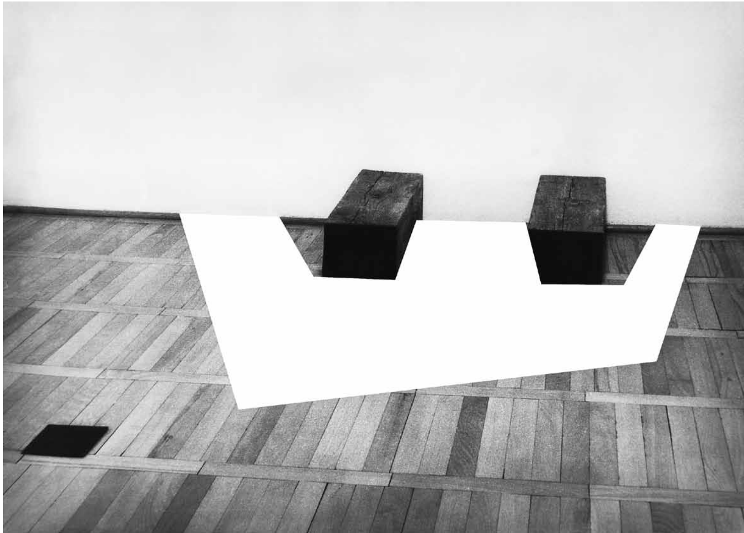
Jan Berdyszak, Momentary Re-installation II, 1993, black-white photography, 60,3 x 86,7 cm, edition: 1/2