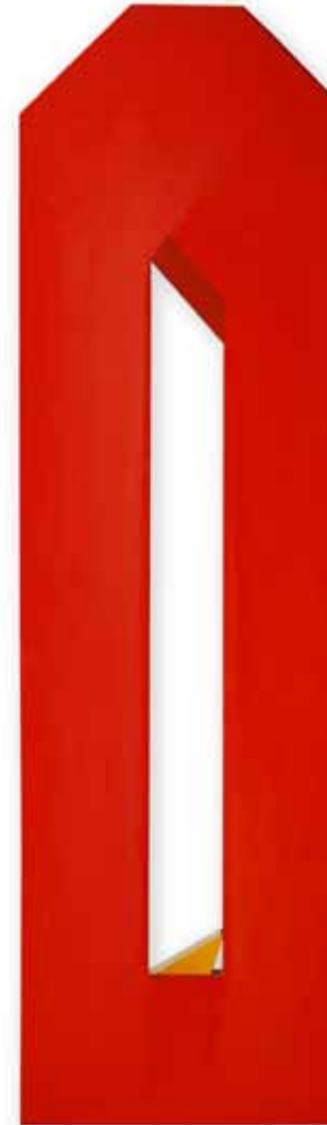
Jan Berdyszak, Passe-par-tout (red) , 1993, plywood, canvas

Jan Berdyszak, Generator of efemeral photographs. Photographic re-installations, Foto-Medium-Art gallery, Kraków 2007