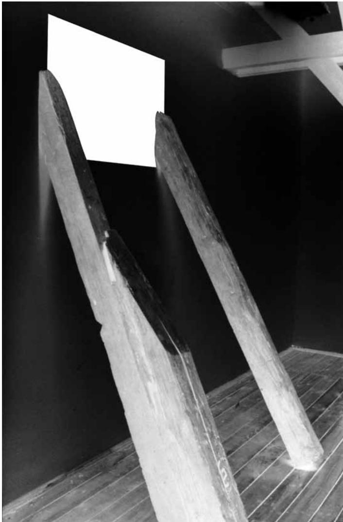
Jan Berdyszak, Two transparencies , 1991/2006, black-white photography, 90 x 59,5 cm, Edition 3/3