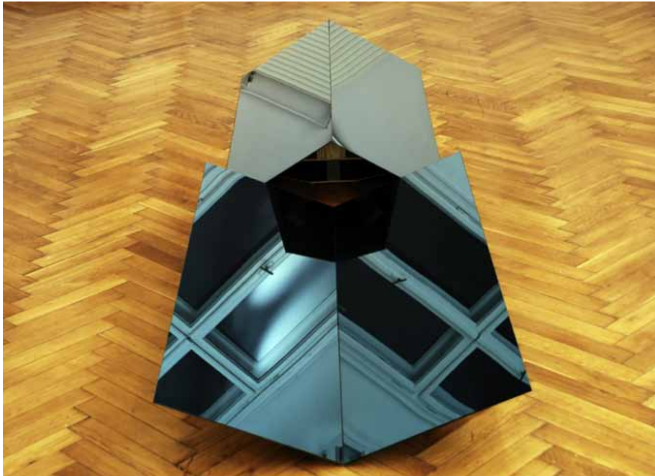
Jan Berdyszak, Generator of efemeral photographs, 2007, four green mirrors, 4 x (47x160) cm